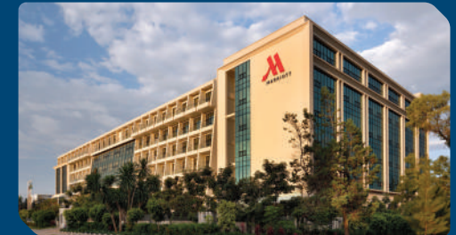
KIGALI MARRIOTT HOTEL